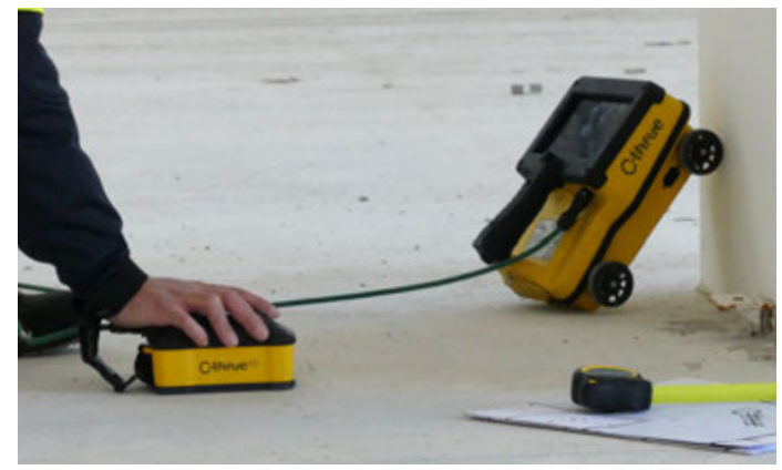
C-thrue XS can be connected via LAN to the C-thrue device allowing for a real-time visualization of the collected data on the multi-touch display.