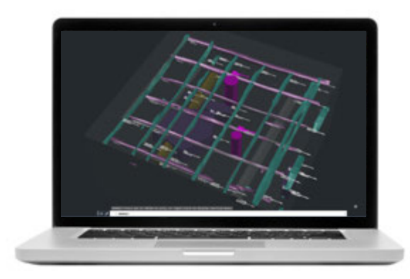
NDT Reveal optimizes the office work flow by using a single software suite for both GPR data analysis and reporting

With NDT Reveal users can attach their jobsite surveys directly to their CAD drawing to seamlessly organize and manage complex Building and Construction projects.